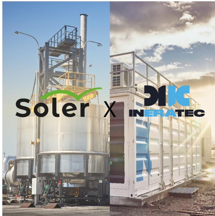
Technological synergies between SOLER's biorefinery and INERATEC's Power-to-Liquid plant.